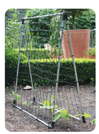
Build a variety of plant support frames

The NEW Harrod Slot & Lock® connectors — researched, designed and developed by the go-ahead company in their Suffolk factory — form one part of an impressive double act which offers reliable, cost effective protection and support to all manner of vegetable patch favourites. When teamed up with 16mm diameter x 1.2mm gauge aluminium tubing, the hi-tech connectors allow creative gardeners to construct climbing support frames or crop protection cages of almost any configuration to ensure birds and other pests don't get a look in when it comes to harvest time.