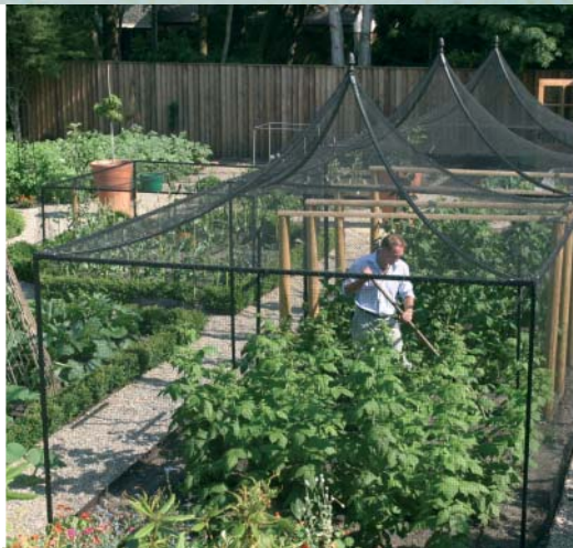
Steel cages at RHS Wisley