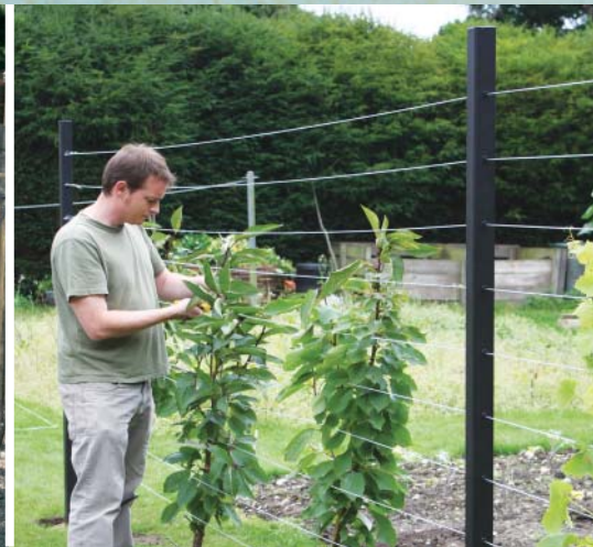
Inspiring new product designs