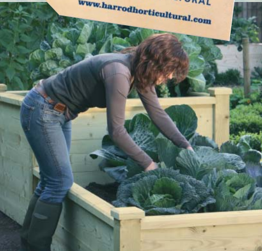
Timber beds at RHS Harlow Carr